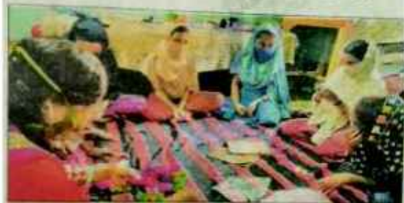
अनन्दशाला में हस्तकला का प्रशिक्षण लेती छात्राएं।

दोषर | प्रतिनिधि। लोकतांत्रिक आदर्शों में स्कूल बच्चों को उत्साह प्रदान करने के उद्देश्य से चेतना विकास एवं कवरेज आंदोलन के संयुक्त प्रयास से दोषर एवं मधुपुर प्रखंड के चयनित 33 उच्च विद्यालय एवं मध्य विद्यालयों में साप्ताहिक समर कैम्प का आयोजन किया गया था। एक सप्ताह तक चलने वाला समर कैम्प रोजाना को सफलता पूर्वक संपन्न हो आया। समर कैम्प में करीब 150 विद्यार्थियों ने भाग लिया।