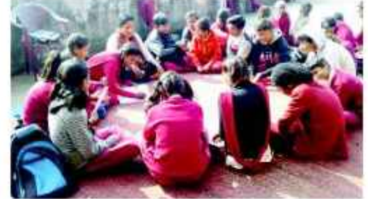
Bal Sansad meeting with the members