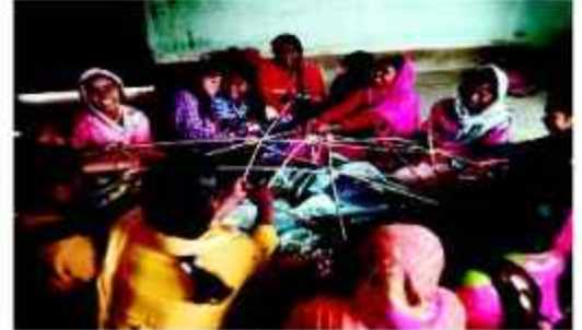
Activity in youth club